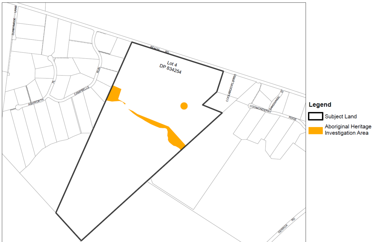
Figure 4: Aboriginal Heritage Investigation Area Map