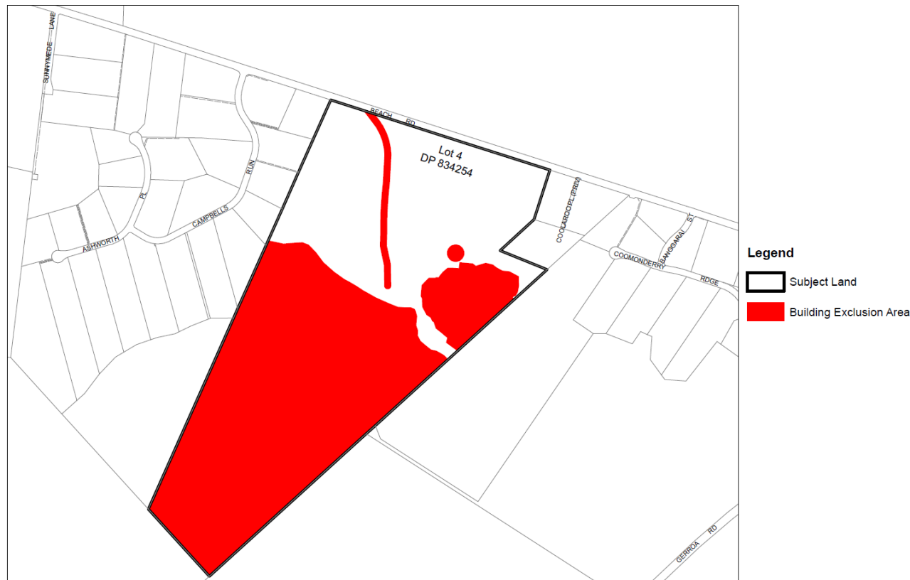
Figure 3: Building Exclusion Map