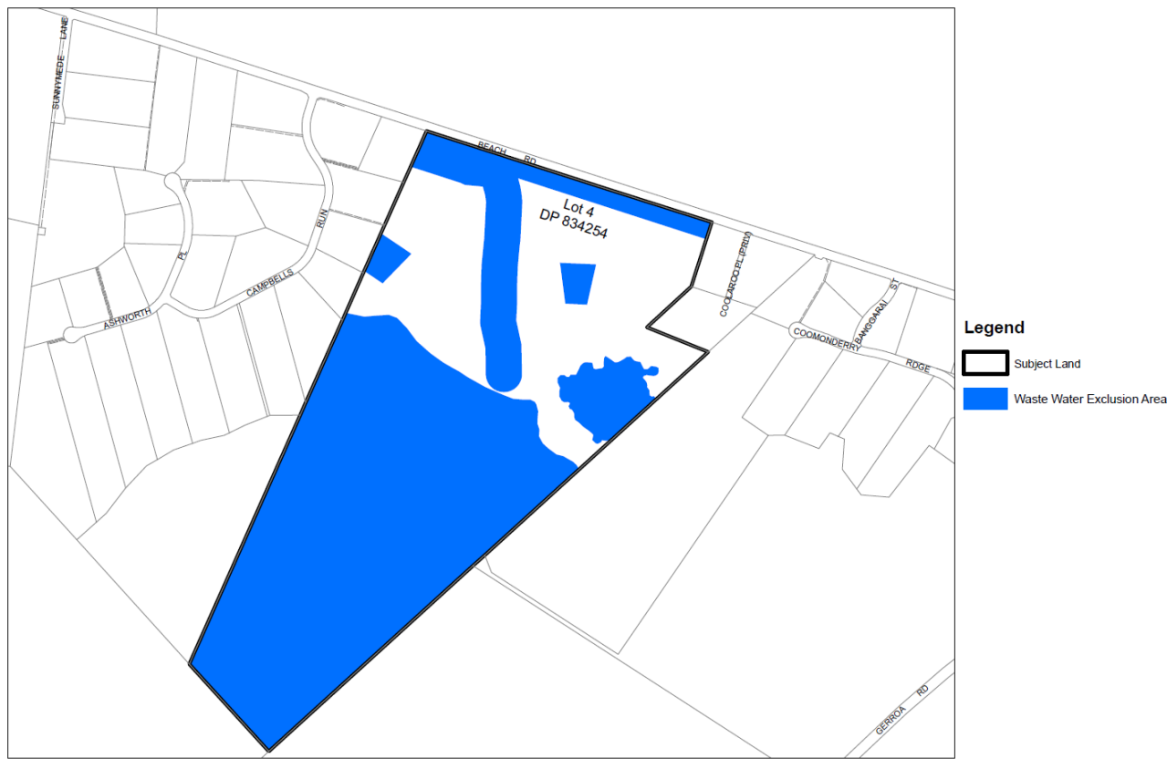
Figure 2: Waste Water Exclusion Map